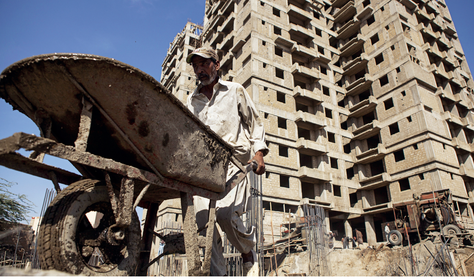
Rapid urbanization and population growth is driving demand for sand for construction in cities such as Karachi in Pakistan.

Educate. Governments, scientists and industry must disseminate information on the issues of sand mining, including those related to social equity, inclusivity and gender. Such information has to span all sectors — from schools to policy advice and media coverage — and must be covered along with