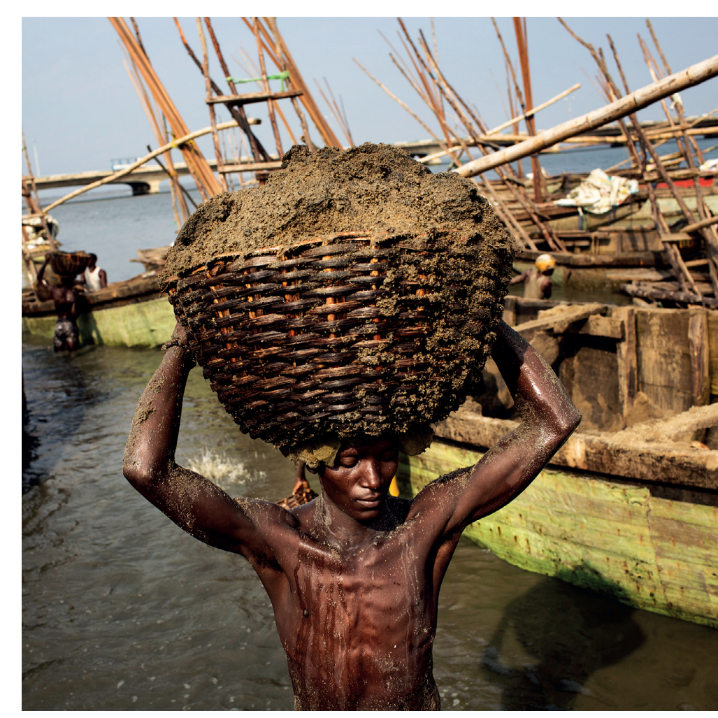
In Lagos Lagoon in Nigeria, labourers dig sand from the sea floor by hand.